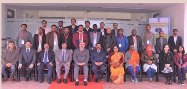
Group photo of participants of "Telecommunications Licensing and Regulation" course

The objective of the Course was to familiarize the participants with the concepts, evolution and current trends of Licensing & Regulation in Telecom, Universal and affordable access of Telecom services, Spectrum management, Standardization and interoperability of Telecom Networks and Dispute resolution framework. They also visited Historical monuments in Delhi as part of Cultural Visit during the course.