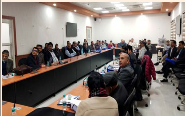
TEC officers participating in the workshop

The workshop was well attended and helped TEC officials in better understanding of the testing solutions. It was the second in a series of workshops. Access Lab (AL) Division is planning few more workshops in coming months.