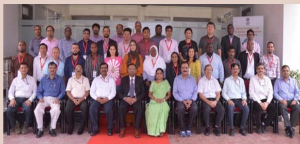
Group photo of participants of ITEC course

One-week course on '5G & IoT' was conducted at CDTI, Ghaziabad. Total 25 participants from 14 countries attended the course. The objective of the Course was to familiarize and develop an understanding of 5G and IoT/M2M and their various related aspects. The course