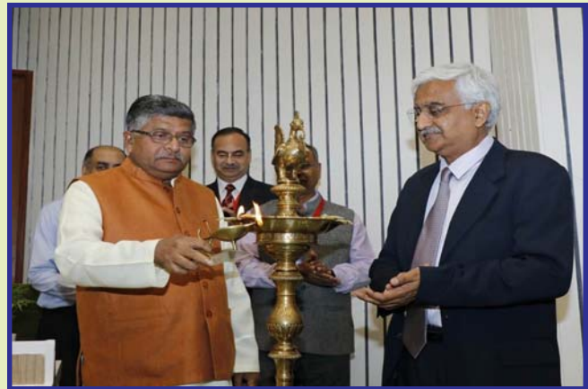
Inauguration of event by Hon'ble Minister