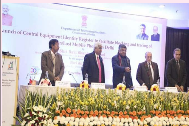
Hon'ble Minister launching CEIR system in Delhi