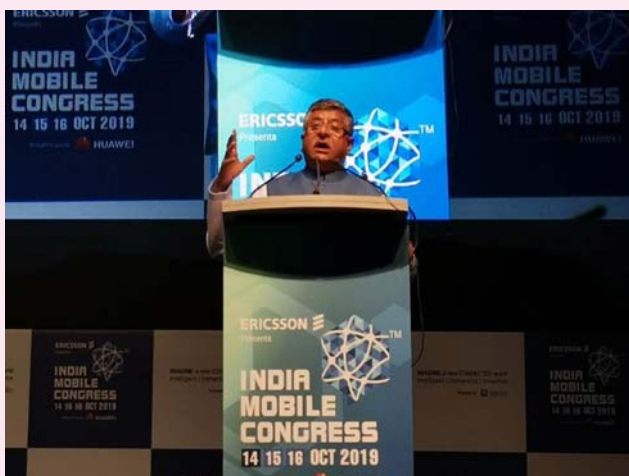
Hon'ble Minister during inaugural session of IMC-2019

Shri Ravi Shankar Prasad, Hon'ble Minister of Communications inaugurated 3rd edition of India Mobile Congress (14-16, OCT 2019) at Aerocity, New Delhi on 14th Oct, 2019 in presence of Shri Anshu Prakash, Secretary(T). MoC chaired the session on "Leaders for the Next Generation". Foreign delegates and eminent persons from Telecom industry were present during the occasion. On 1 st day of IMC-2019, various sessions were held on 5G, IOT, AI, Smart City, Cloud and other important topics. Leadership/CEO's Conclave event was held on 2nd day of IMC-2019. Shri Anshu Prakash, Secretary(T) also addressed during an event on Make in India held on 15th Oct, 2019. On last day (16th Oct, 2019), Secretary(T)