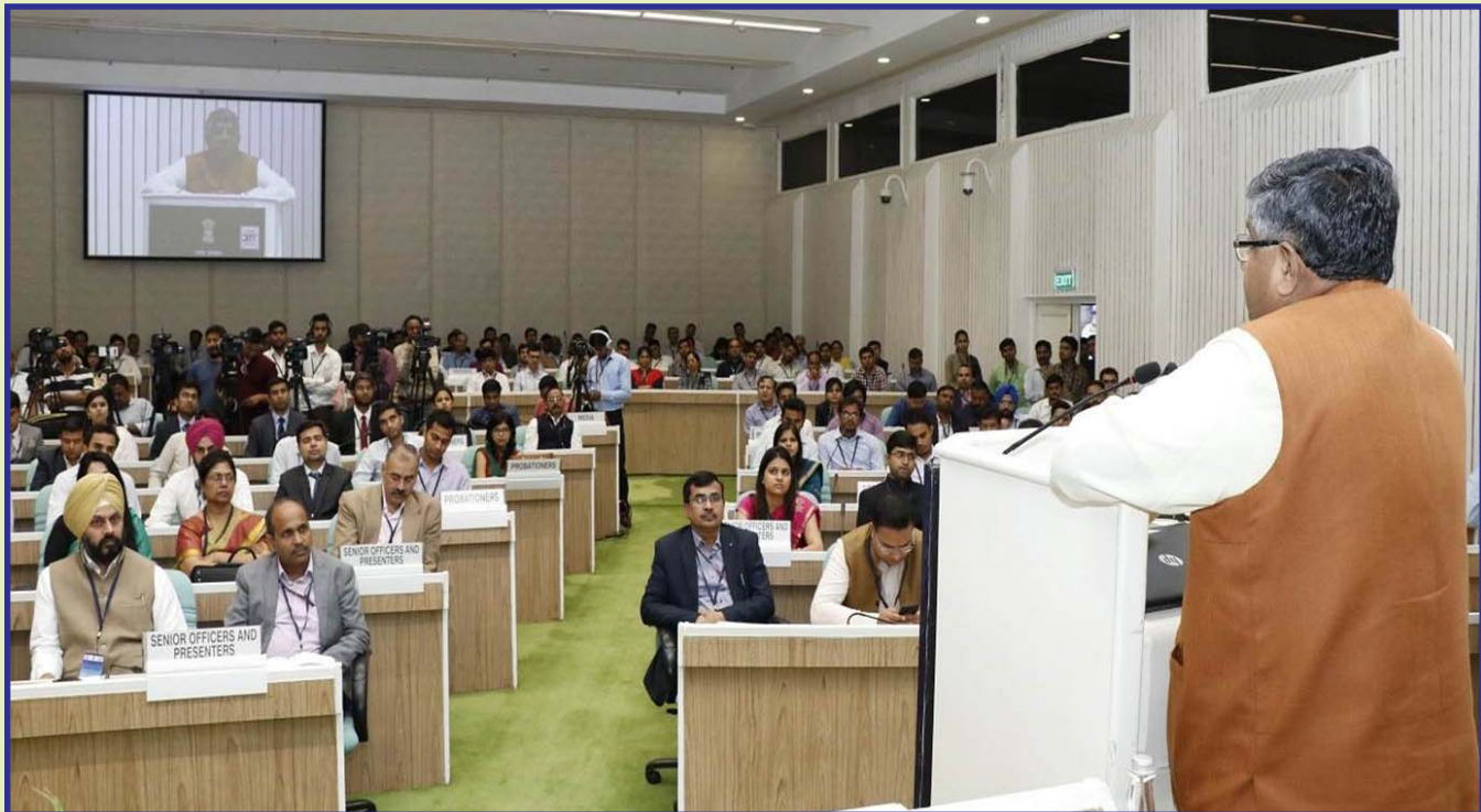
Hon'ble Minister addressing DoT/TEC officers during interactive session