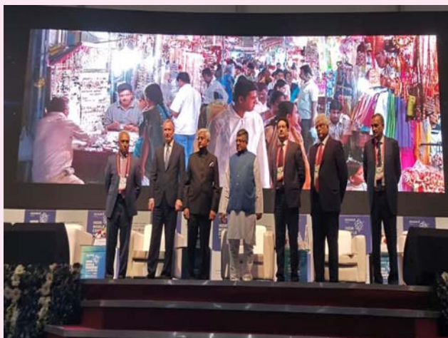
Inaugural session of IMC-2019

released a White Paper during CIO Conclave, and Grand Innovation Challenge Award Ceremony was also held in IMC-2019.