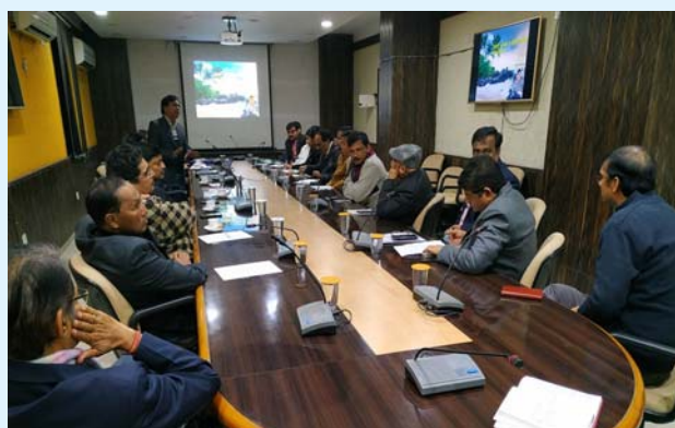
(हिन्दी कार्यशाला में उपस्थित अधिकारी – कर्मचारी गण)