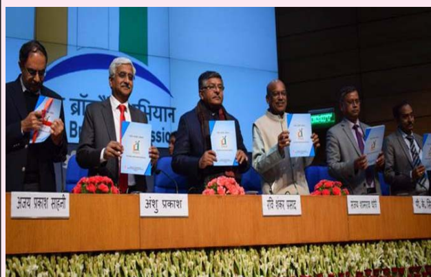
Hon'ble Minister inaugurating National Broadband Mission

On 17 DEC 2019, Shri Ravi Shankar Prasad, Hon'ble Minister of Communications launched the National Broadband Mission (NBM) at an event held at National Media Centre, New Delhi in the presence of Shri Sanjay Dhotre, Hon'ble Minister of State for Communications. On this occasion, Hon'ble MOC released the logo and mission document of NBM. Secretary (T), Industry representatives, officials from various Central Ministries, State Governments, DoT and media persons were also present in the event. NBM Mission is to provide affordable and universal access broadband to all; all villages to have access to Broadband by 2022.