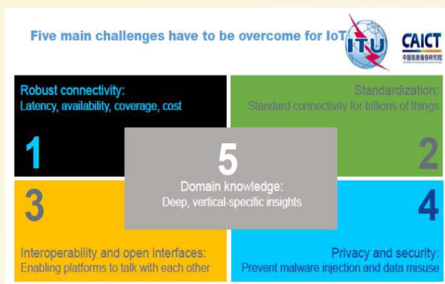
Figure – 3