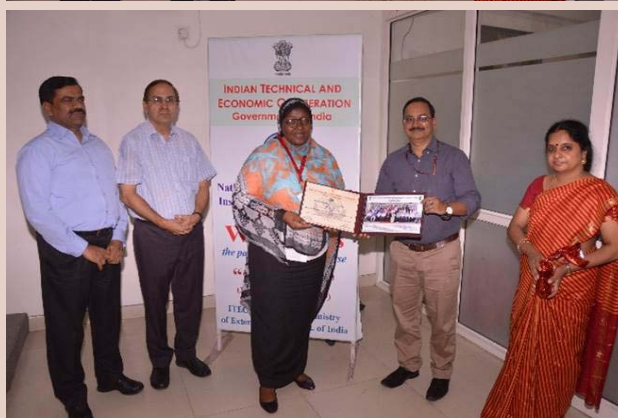
Glimpse of Valedictory programme of the course